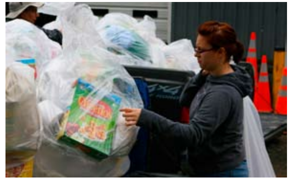
Loading bags into truck for distribution

Once we loaded the biggest bags in the trucks, we split into two