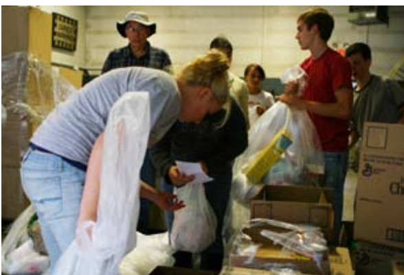
NHS Students Filling Relief Bags