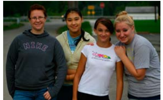
A Job Well Done!

groups. We hopped back on the tailgates and rode around town giving out the care packages to the flooded, hard hit areas.